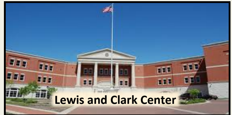
Lewis and Clark Center

All symposium activities will be conducted at the Lewis and Clark Center. Lunch is not provided.