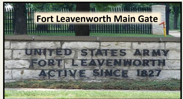
Fort Leavenworth Main Gate